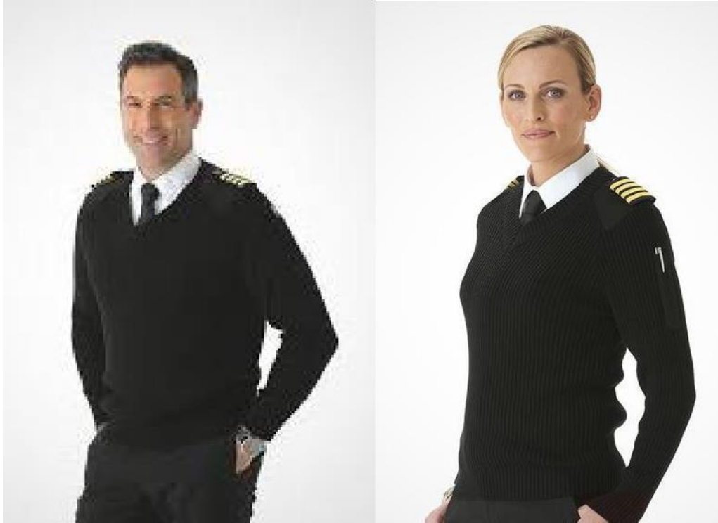
Winter Classroom Outfit